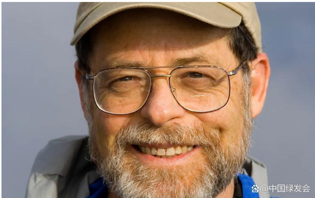
Edwin Birnbaum diagram CSVPA