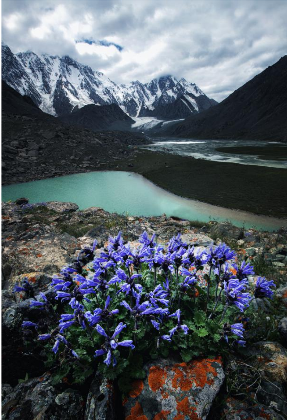
( Dracocephalum rupestre )