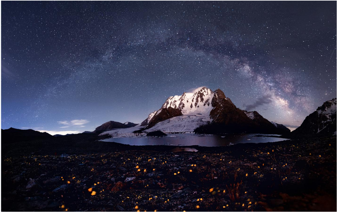
(Bogda under the Milk Way )