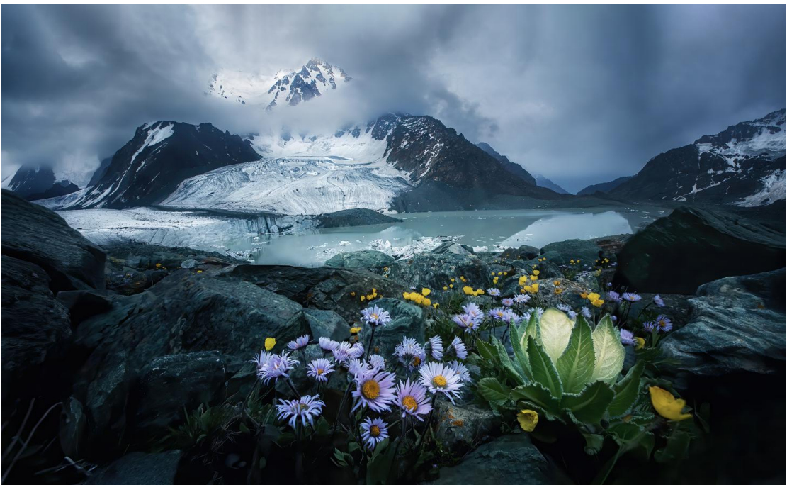
(Snow lotus and the snow mountain)