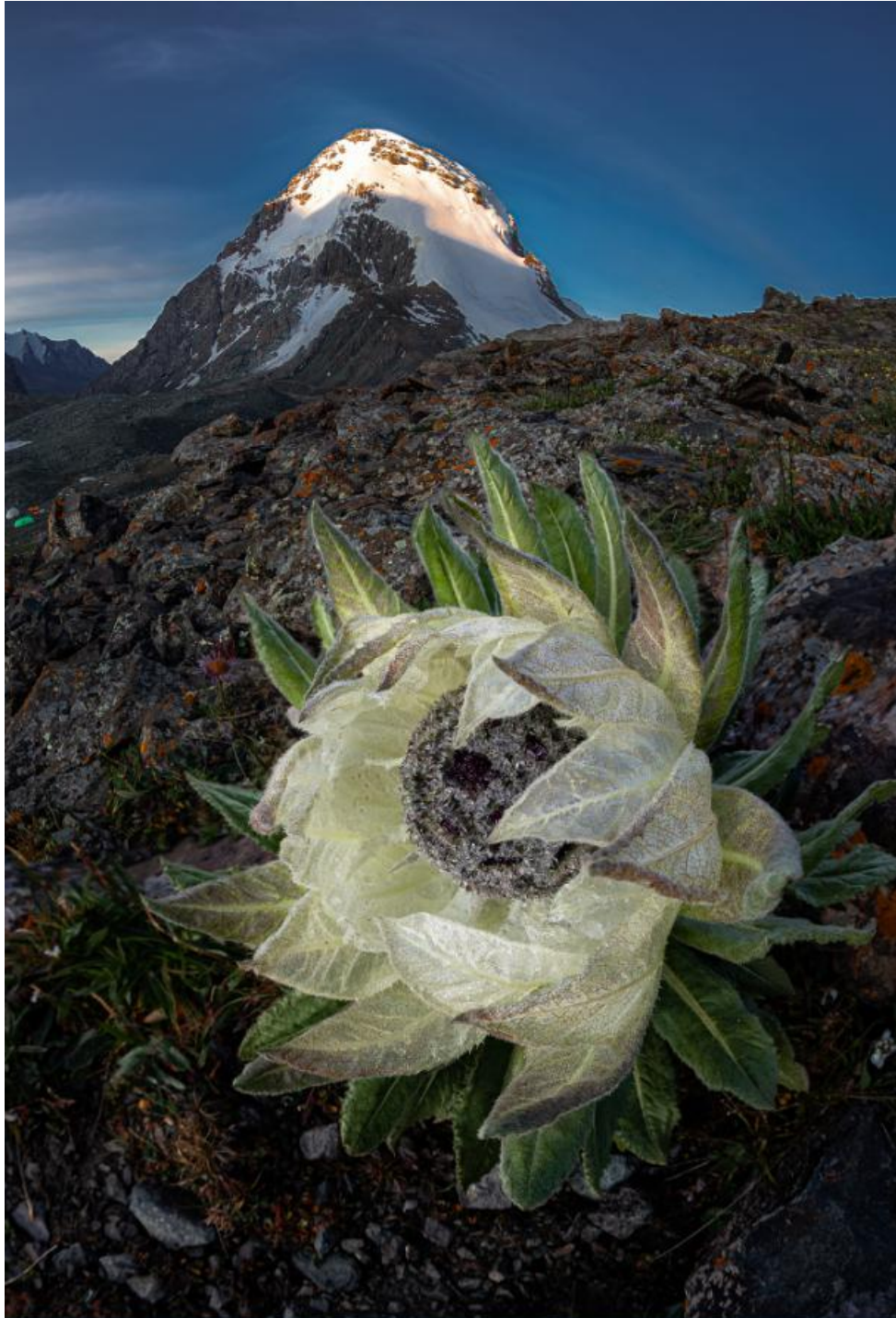
(A snow lotus in full blossom can be as large as 25 centimeters in diameter)