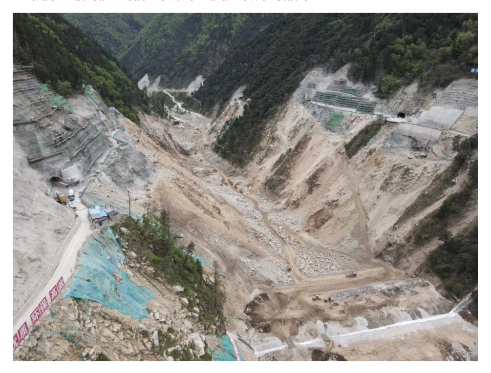
The construction site of the Bara power station