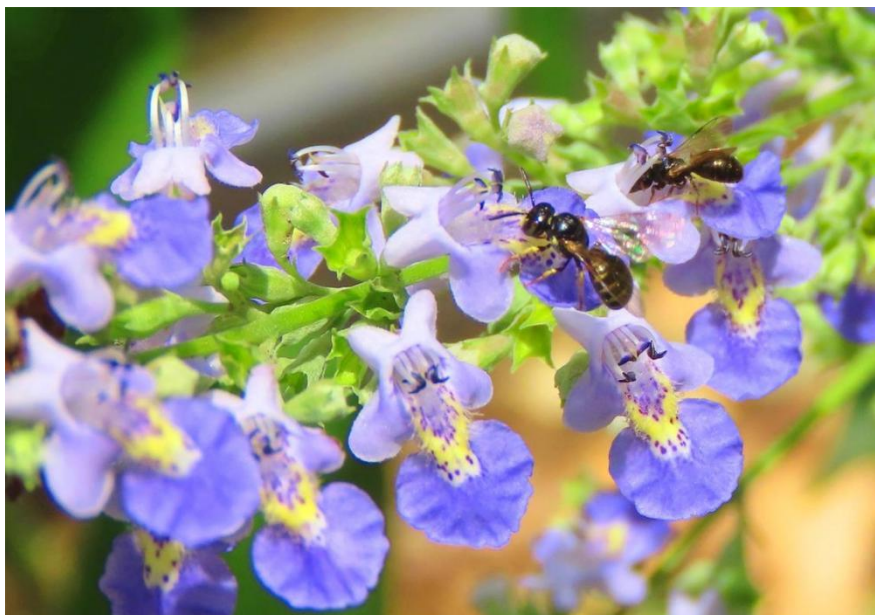
Vitex negundo var. heterophylla (Franch.) Rehd.