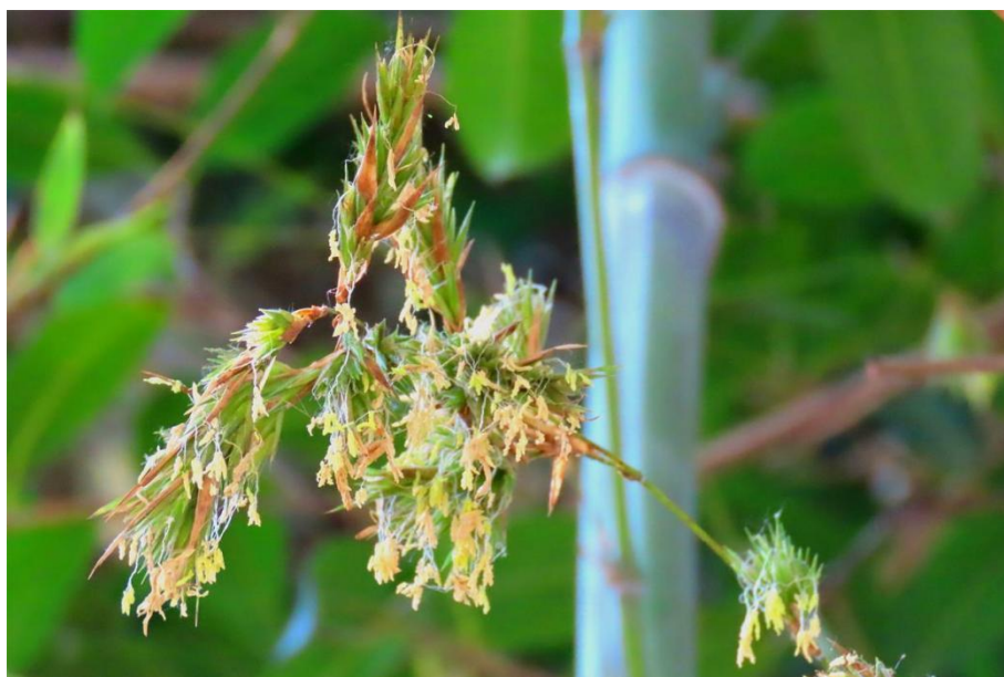
Phyllostachys nigra (Lodd ex Lindl.) Munro