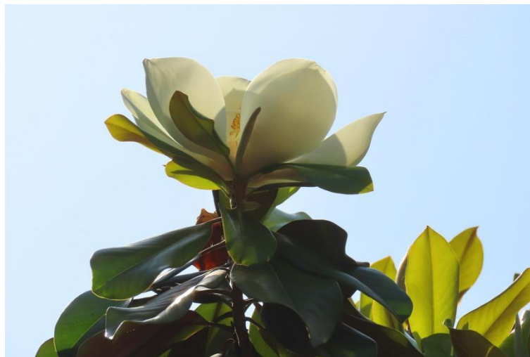
Magnolia grandiflora L.