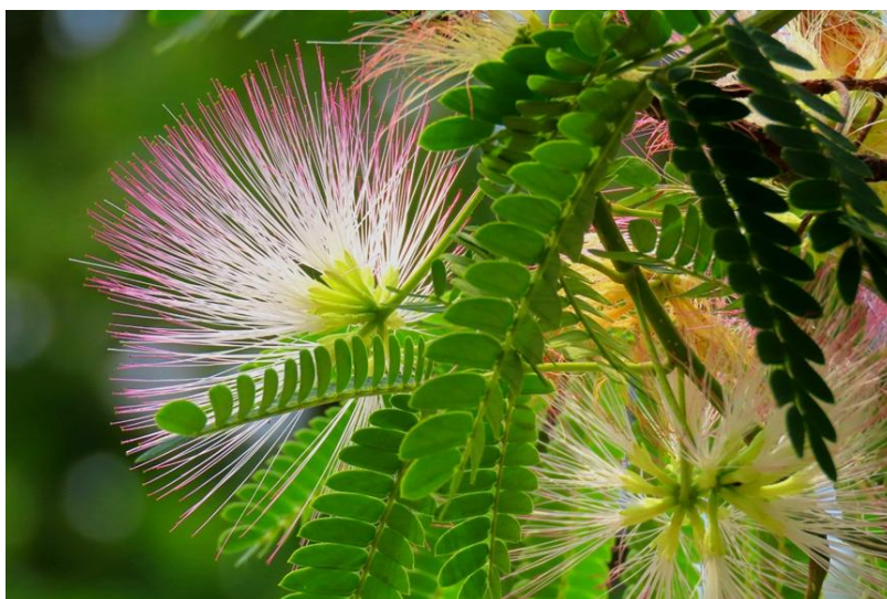
Albizia julibrissin Durazz.